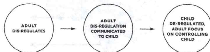
Figure 2. IMPACT OF ADULT DYSREGULATION ON THE CHILD.

It is very helpful to appreciate that when a child says, "I don't know" it is largely because they don't have the neural networks to understand and work it out for themselves. Supportive learning and supportive, enriched home environments facilitate learning by activating the pre-frontal cortex, or smart brain, depending upon the child's developmental level. Fear based learning creates more neuronal connections because the child learns quickly through fear, but these neurons and other connections die off as quickly as they are made. In contrast, supportive environments create new brain cells and learning is retained (Cozolino, 2014a; Siegel, 2011).