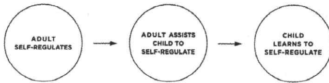
Figure 1. IMPACT OF ADULT SELF-REGULATION ON THE CHILD.

self-regulate, and the child is then more able to self-regulate in their own way (see Figure 1) (Vanderaa, 2019). After all, children have not been on this planet for very long and they need us to teach them how to navigate the complexities of life!